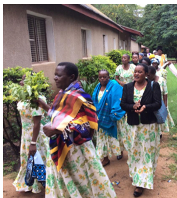
Attending the World Day of Prayer in Kondo